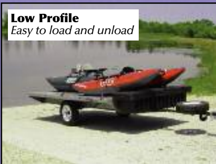
Low Profile Easy to load and unload