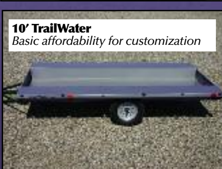
10' TrailWater Basic affordability for customization