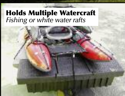
Holds Multiple Watercraft Fishing or white water rafts