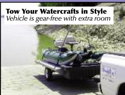
Tow Your Watercrafts in Style Vehicle is gear-free with extra room