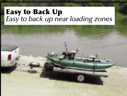
Easy to Back Up Easy to back up near loading zones