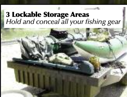
3 Lockable Storage Areas Hold and conceal all your fishing gear